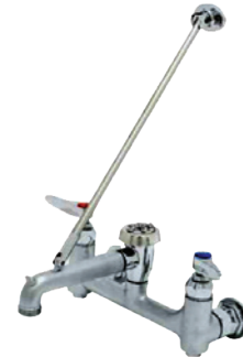
B-0665 - BSTR