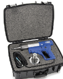
UPONOR 201 CORDED EXPANDING TOOL