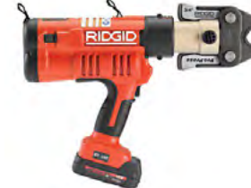
BATTERY PRESS TOOL