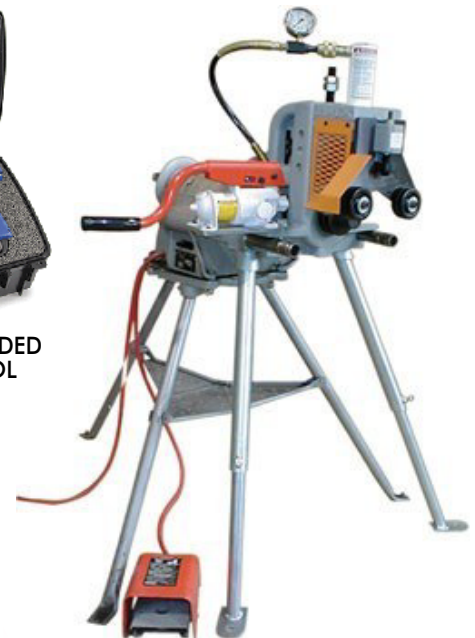
GRUVLOK 3006 ROLL GROOVER