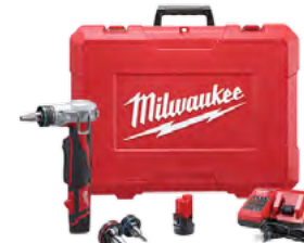
M12 PEX UPONOR EXPANDING TOOL