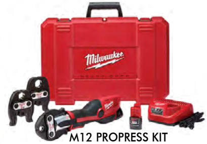
M12 PROPRESS KIT