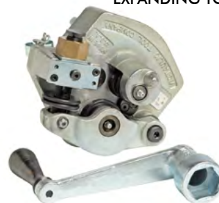
VICTAULIC ROLL GROOVER

Ask a Yeager Supply sales representative to check availability & to schedule rental