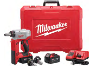
M18 PROPEX TOOL KIT