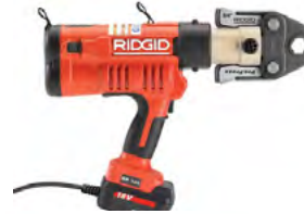
CORDED PRESS TOOL