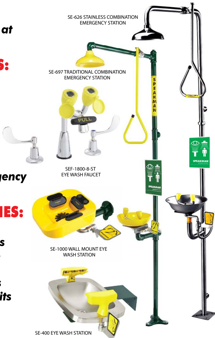
SE-400 EYE WASH STATION