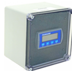
SINGLE NEMA BOX