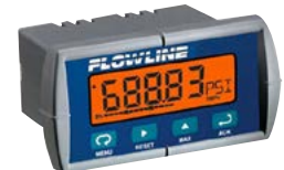
L125-2 Intrinsically Safe Indicator