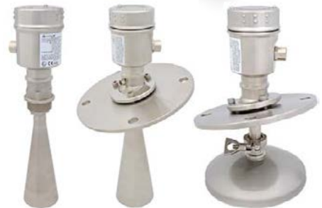
LR36 LR41 LR46 EchoPro® Intrinsically Safe