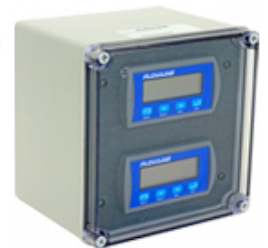
DOUBLE NEMA BOX