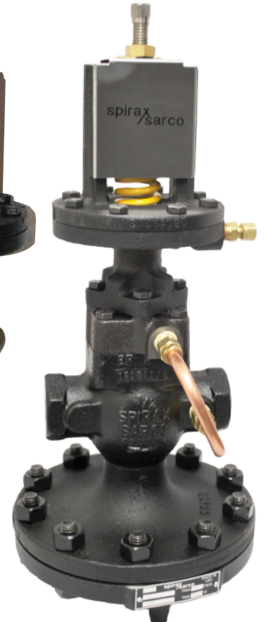
25 SERIES REGULATOR