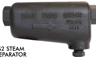
S2 STEAM SEPARATOR