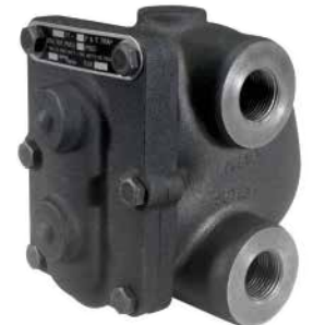
FT-15 FLOAT & THERMOSTATIC STEAM TRAP

View our complete linecard at yeagersupply.com