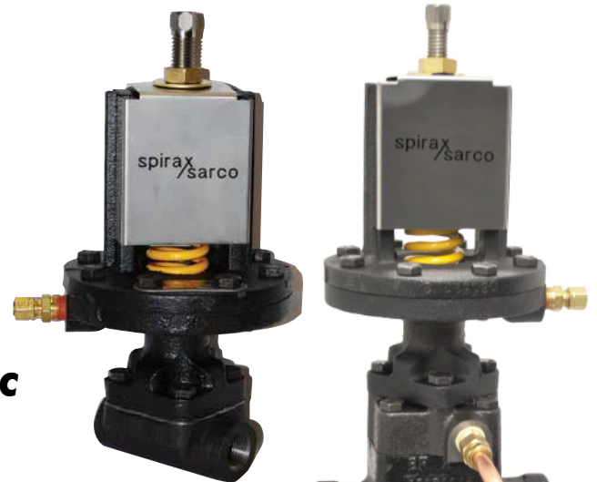
25 MP DIRECT ACTING VALVE