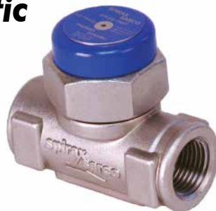
TD52 THERMO-DYNAMIC STEAM TRAP