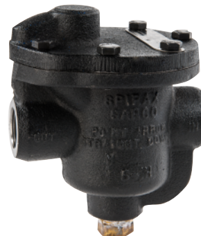
B1H INVERTED BUCKET STEAM TRAP