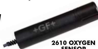
2610 OXYGEN SENSOR