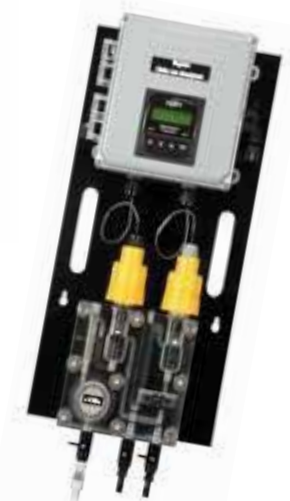
4630 CHLORINE ANALYZER SYSTEM