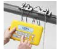
PORTAFLOW 220/330 PORTABLE