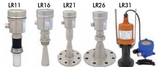
EchoPro® Intrinsically Safe