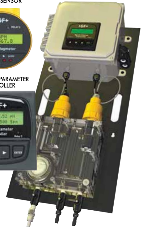
4630 CHLORINE ANALYZER SYSTEM