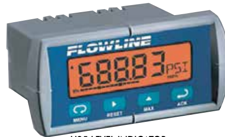
LI25 LEVEL INDICATOR

Flowline - Thermal flow switch sensors, liquid & gas sensor types, level switches, radar sensors