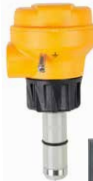
2551 MAGMETER FLOW SENSOR

Services Performed by Factory Trained Personnel