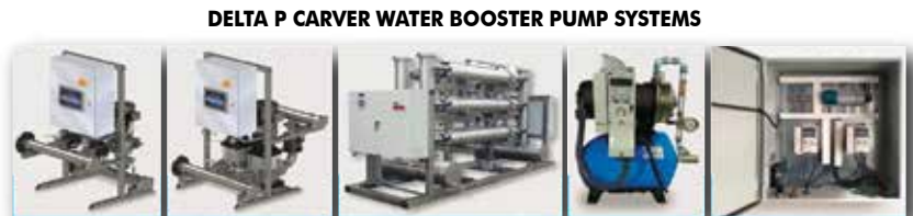
DELTA P CARVER WATER BOOSTER PUMP SYSTEMS