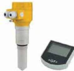
2290 NON-CONTACT RADAR