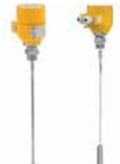
2291 GUIDED WAVE RADAR