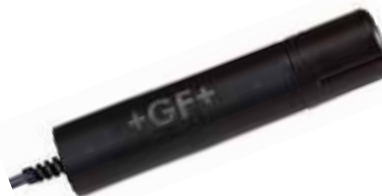
2610 DISSOLVED OXYGEN SENSOR