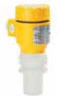
2260 PVDF ULTRASONIC