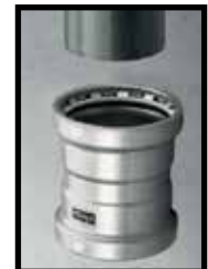
Viega MegaPress XL