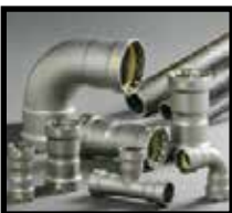
Viega MegaPress G