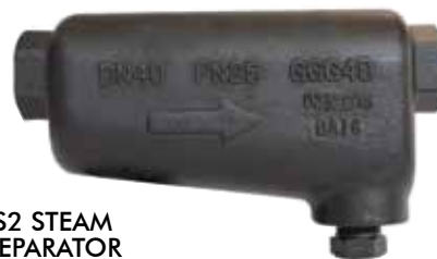
S2 STEAM SEPARATOR