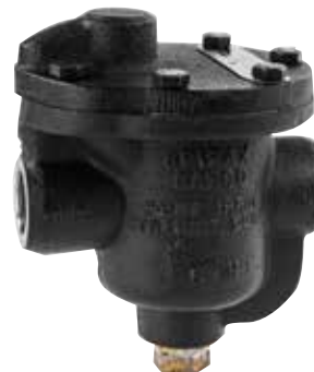
B1H INVERTED BUCKET STEAM TRAP