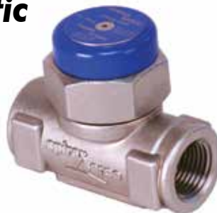
TD52 THERMO-DYNAMIC STEAM TRAP