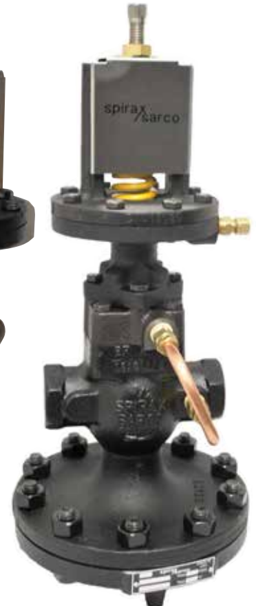
25 SERIES REGULATOR