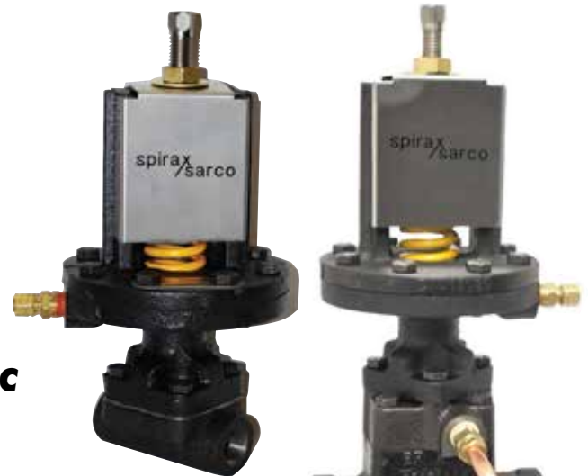
25 MP DIRECT ACTING VALVE