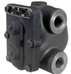
FT-15 FLOAT & THERMOSTATIC STEAM TRAP

View our complete linecard at yeagersupply.com