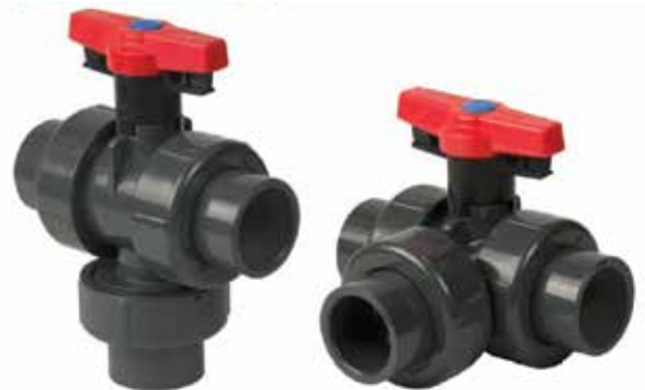
NEW: SPEARS TRUE UNION 3-WAY FULL PORT BALL VALVES FOR INDUSTRIAL & CHEMICAL PROCESSING