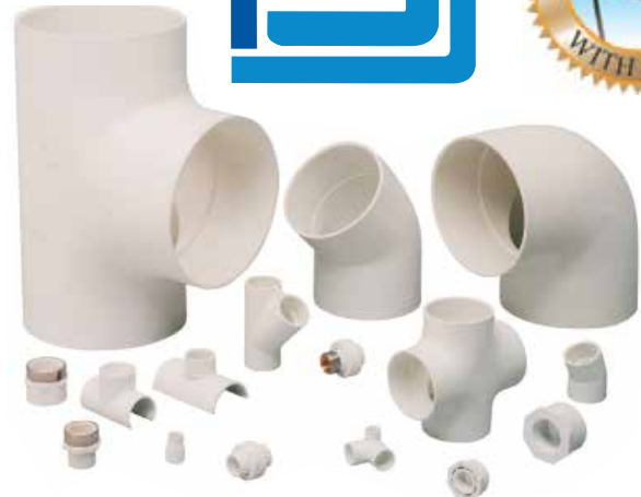
PVC SCHEDULE 40