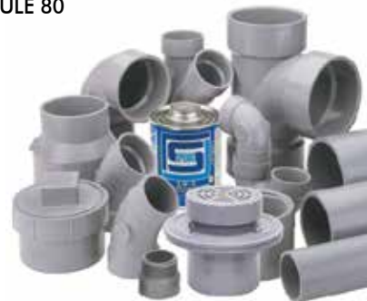
CPVC LAB WASTE

We also have many sizes of adapters with various ends in stock