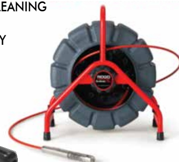
SEESNAKE MINI VIDEO INSPECTION SYSTEM