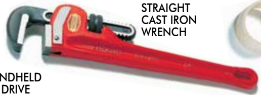
STRAIGHT CAST IRON WRENCH