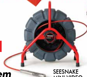
SEESNAKE MINI VIDEO INSPECTION SYSTEM