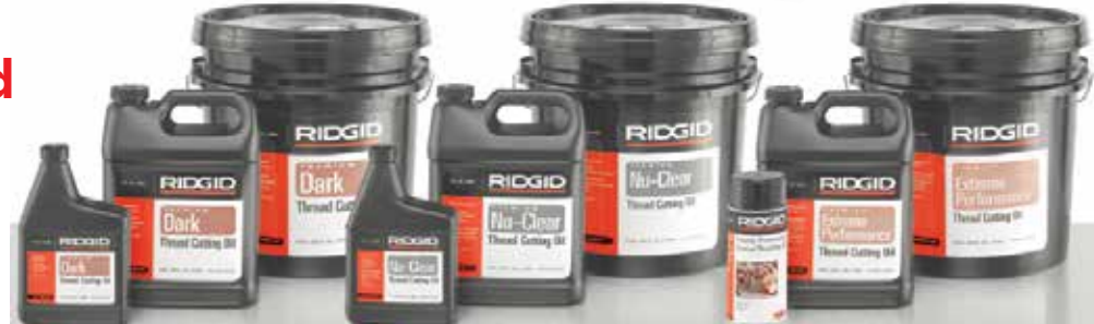
THREAD CUTTING OILS

View our complete linecard at yeagersupply.com