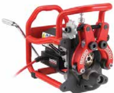
MODEL B-500 TRANSPORTABLE PIPE BEVELER