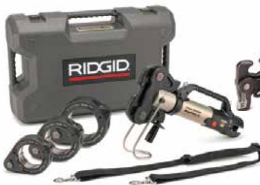
RIDGID MEGAPRESS XL BOOSTER 60638 WORKS WITH 300 SERIES RIDGID PRESS TOOL