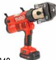
RP 340 BATTERY TOOL