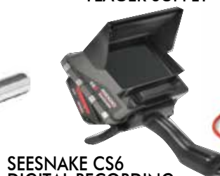
SEESNAKE CS6 DIGITAL RECORDING MONITORS