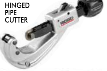
HINGED PIPE CUTTER