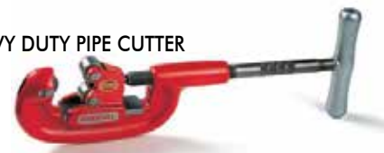
HEAVY DUTY PIPE CUTTER