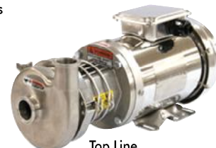
Top Line Sanitary Pumps