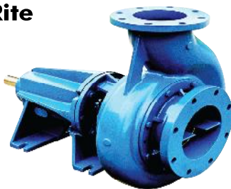
Carver Centrifugal Pumps