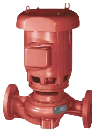
Bell & Gossett Centrifugal Pumps