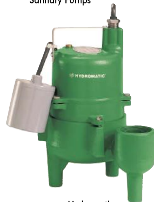
Hydromatic Submersible Pumps