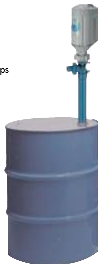
Finish Thompson Drum Pumps