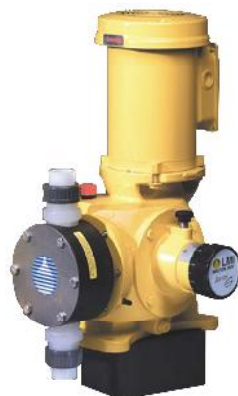
LMI Metering Pumps

Services Performed by Factory Trained Personnel