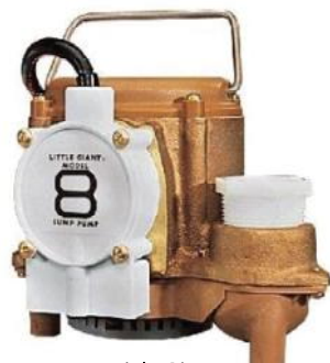
Little Giant Submersible Pumps

ABS/Sulzer Liberty Armstrong Little Giant Bell & Gossett LMI Becker March Carver Myers Dixon Pacer Ebara Pentair/Sta-Rite Finish Thompson Berkeley Flex-A-Seal Rule Flygt Scot Grundfos Serfilco Hayward Gordon Stenner Hoffman Taco Hydromatic Topline Lancaster Pump