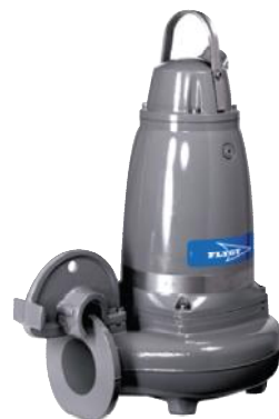
Flygt Submersible Pumps